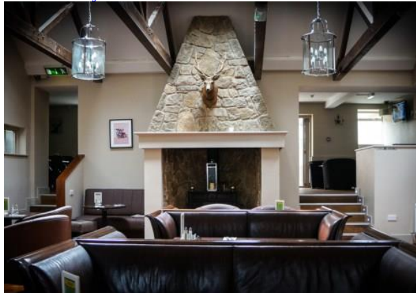
Day 2 & 3: Enniskerry Enniskerry Inn