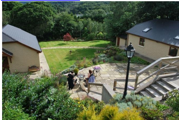
Day 3 & 4: Laragh/Glendalough Heather House B&B