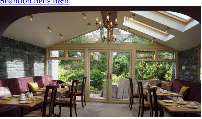
Day 3: Ahakista / Kilrohane Bridgeview House