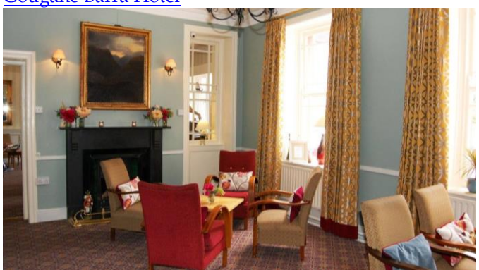
Day 4 & 5 : Baltimore Beacon Shore Guesthouse

Day 2: Gougane Barra Gougane Barra Hotel