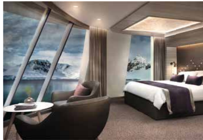
EXPEDITION SUITE, MINI SUITE

SHIP YARD: Kleven Verft (N) FLAG: Norway YEAR OF CONSTRUCTION: 2002 (Year of refurbishment 2020) GROSS TONNAGE: 15,690 t CABINS: 263 OVERALL LENGTH: 138.5 m BEAM: 21.5 m SERVICE SPEED: 15 knots