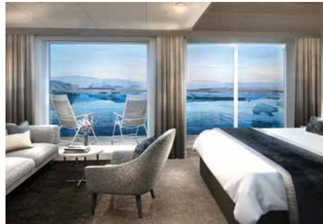
EXPEDITION SUITE, SUITE WITH PRIVATE BALCONY